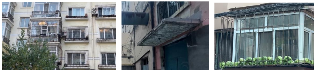
(a) 窗框挑出 Window frame protrudes (b) 屋檐 Eaves (c) 阳台 Balcony