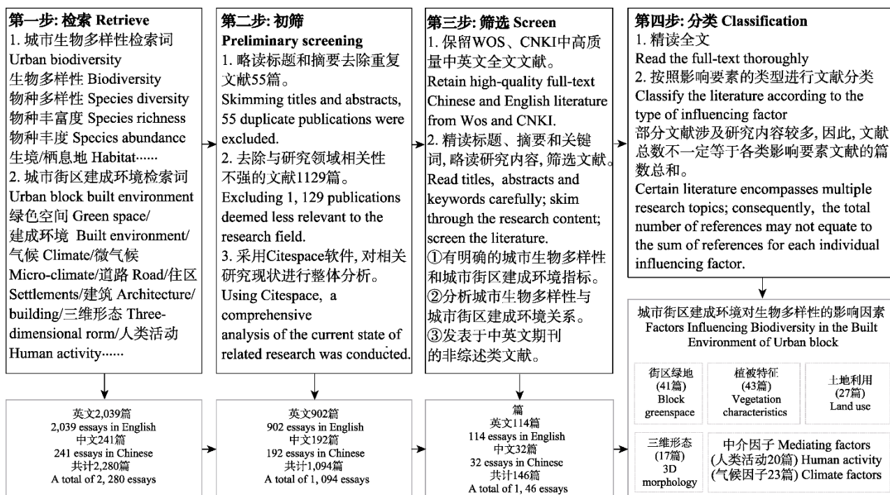
附录1 文献检索与筛选流程 Appendix 1 Literature search and screening flowchart