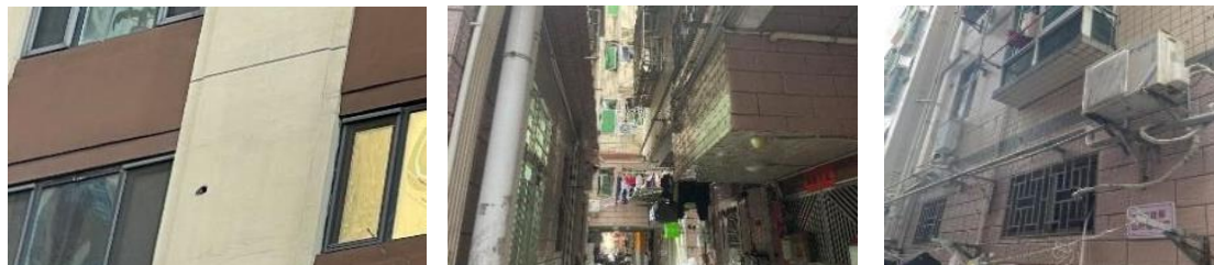
(a) 孔洞 Wall holes (b) 管道 Pipeline (c) 空调外机位 Air conditioner outdoor unit location