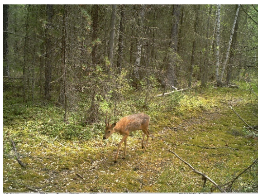
狍 Capreolus pygargus