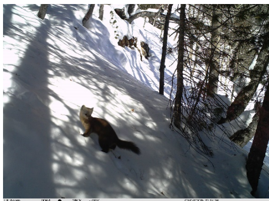
紫貂 Martes zibellina