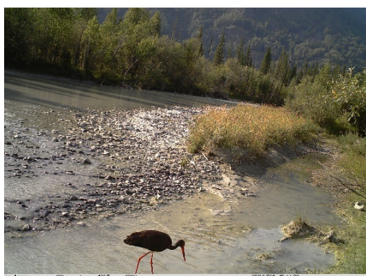
黑鹳 Ciconia nigra