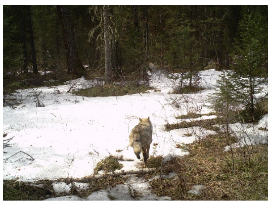
狼 Canis lupus