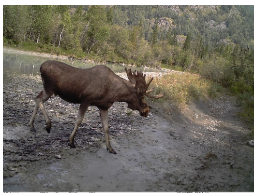
驼鹿 Alces alces