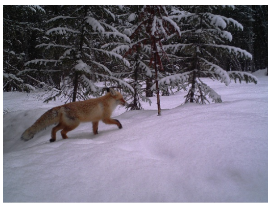
赤狐 Vulpes vulpes