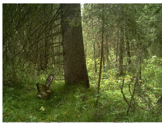
欧亚鸮 Buteo buteo