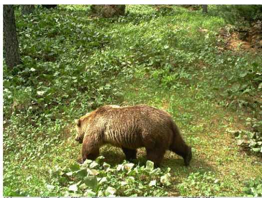
棕熊 Ursus arctos