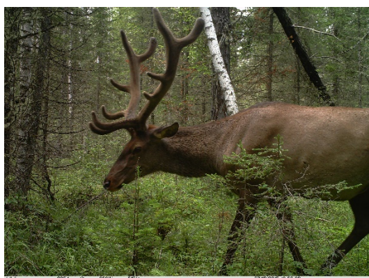
马鹿 Cervus canadensis