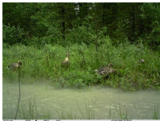
豆雁 Anser fabalis