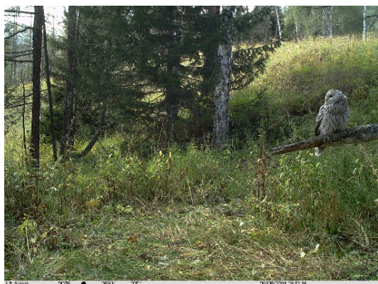
长尾林鸮 Strix uralensis